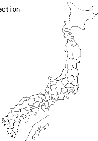
(no case) Rota A