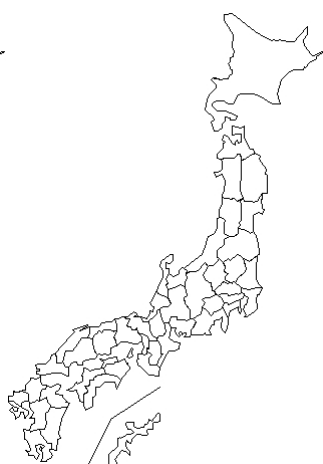
no case B(Yamagata lineage)