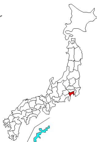
49 cases Suspected case of 2019-nCoV infection